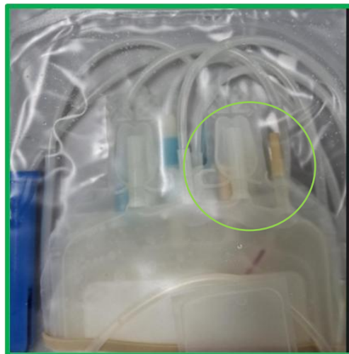
Picture taken of the device in the overwrap with two visible plugs: one on the empty bag and one on the bag with the additive solution.