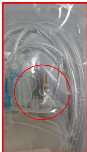
Picture taken of the device in the overwrap with only ONE visible plug.