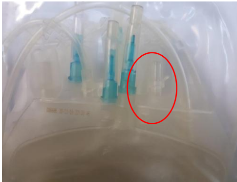
Picture taken of the device in the overwrap