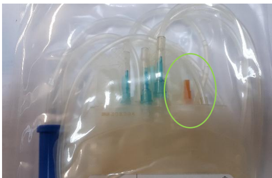
Picture taken of the device in the overwrap