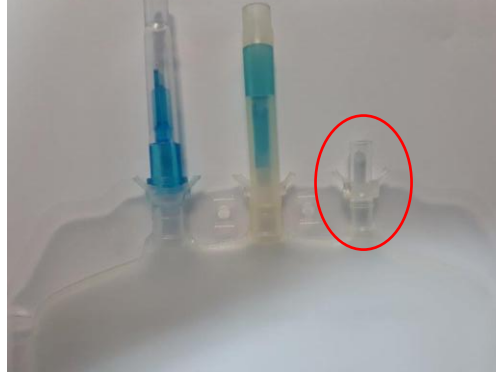
Picture of the bag CV1459 without plug